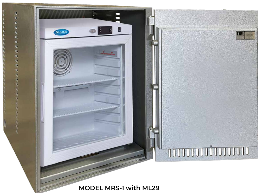
MODEL MRS-1 with ML29