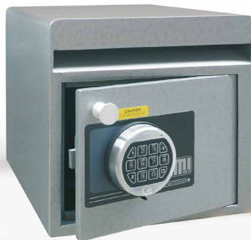
MODEL DEP 3D

MINI DEPOSIT SAFES are ideal for moderate security where multiple staff need to deposit money into the safe.