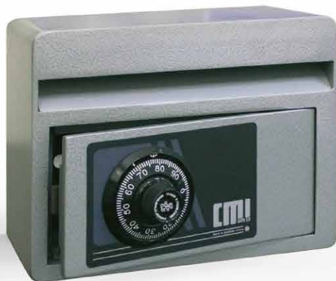
MODEL DEP 2C