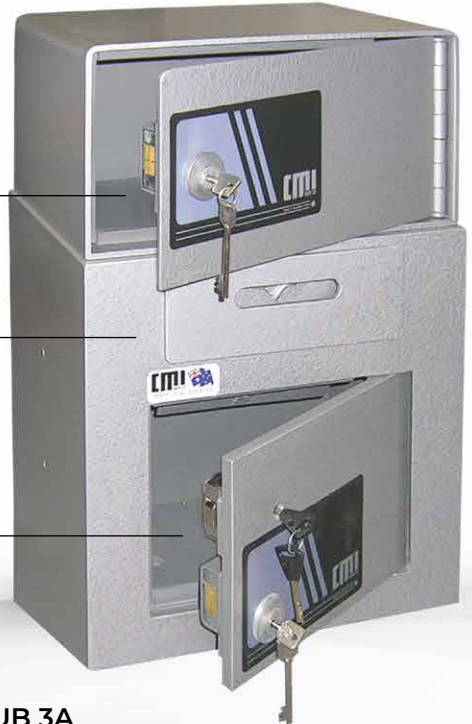
MODEL SUB 3A