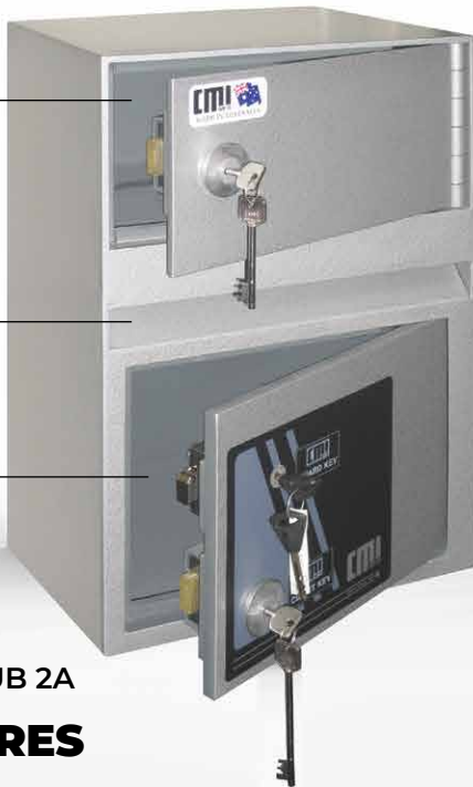
MODEL SUB 2A