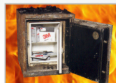
Safely protected data materials