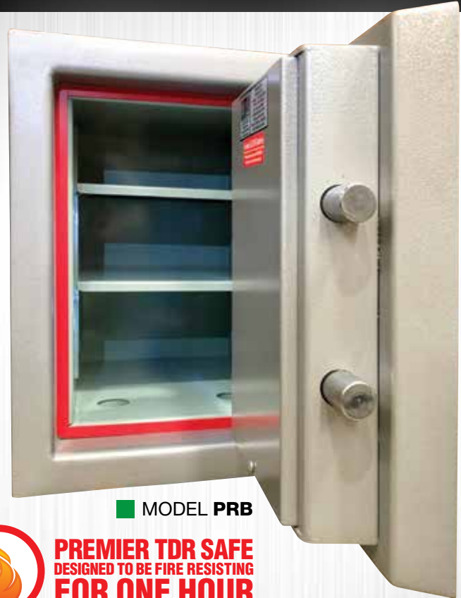
■ MODEL PRB