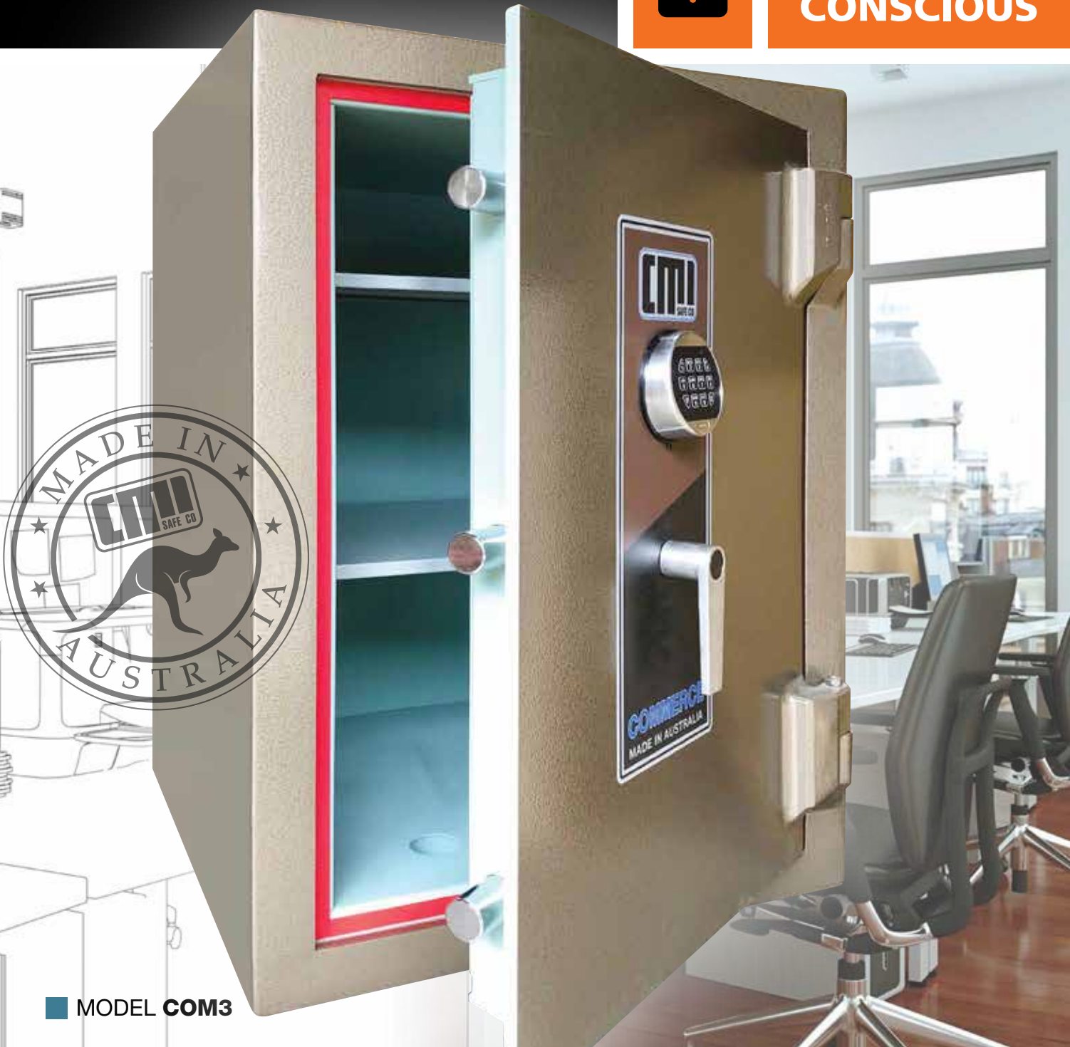
■ MODEL COM3