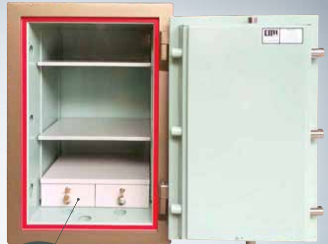
■ MODEL COM3