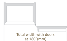
● 1040 ● 1070