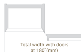
● 1240 ● 1240

Safeguard Safes safeguardsafes.com.au | 1300 764 971 sales@safeguardgroup.com.au