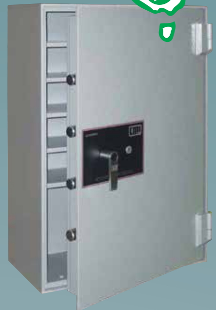
■ MODEL DS900