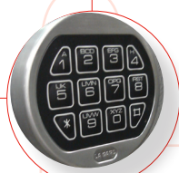
optional electronic lock