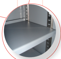
fully adjustable shelving system