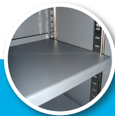
FULLY ADJUSTABLE SHELVING SYSTEM