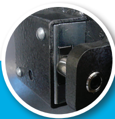
STAINLESS STEEL RETRACTABLE BOLTWORK