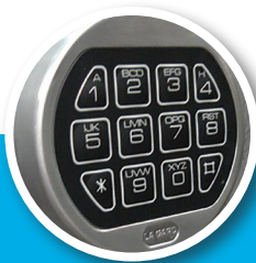
OPTIONS FOR AN ELECTRONIC LOCK